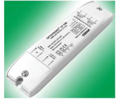
OT-DIM Osram Sylvania

The Osram Sylvania OT-DIM module provides open circuit, short circuit, overload and overheating protection. Using pulse width modulation, the power supply to the LED modules is interrupted at a frequency of 135 Hz. This provides flicker-free, smooth dimming control.