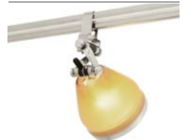
M-VES-SN-S3-AM-SN Vespa in Satin Nickel with Satin Nickel S3 Amber Shade