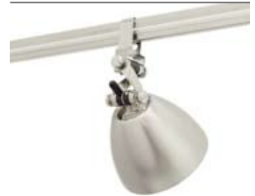
M-VES-SN-S1-SN Vespa in Satin Nickel with Satin Nickel S1 Shade