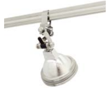
M-VES-SN-LH16-SN Vespa in Satin Nickel with Satin Nickel Louver Lens Holder LED Compatible