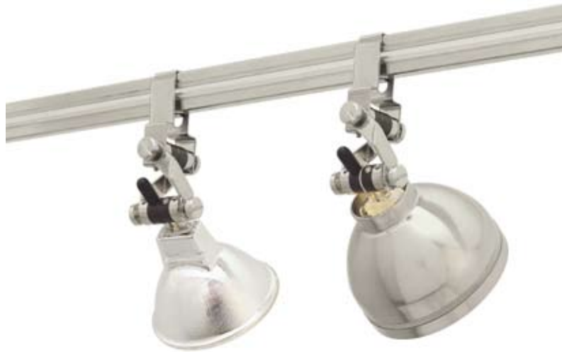
M-VES-SN Vespa in Satin Nickel with MR16 Lamp (sold separately) LED Compatible