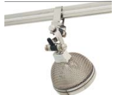
M-VES-PN-S7-PN Vespa in Polished Nickel with Polished Nickel S7 Shade LED Compatible