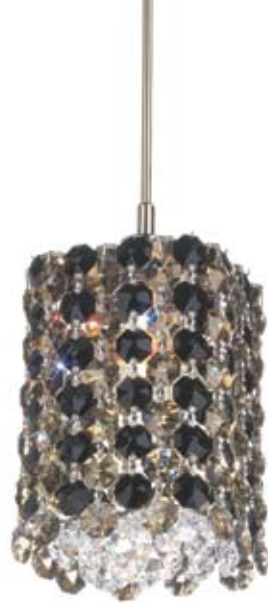
FJ-RE0405JG-12-SN Jaguar Black