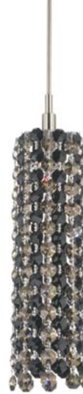
FJ-RE0209JG-12-SN Jaguar Black