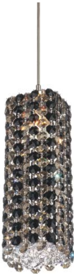
FJ-RE0409JG-12-SN Jaguar Black