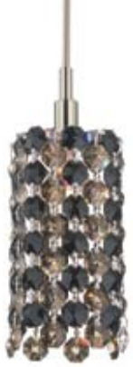
FJ-RE0205JG-12-SN Jaguar Black