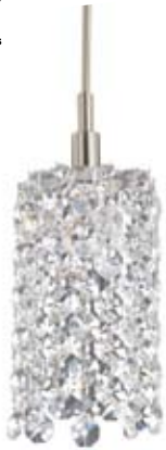
FJ-RE0205A-12-SN Grade A Clear