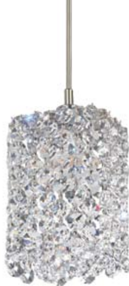
FJ-RE0405A-12-SN Grade A Clear