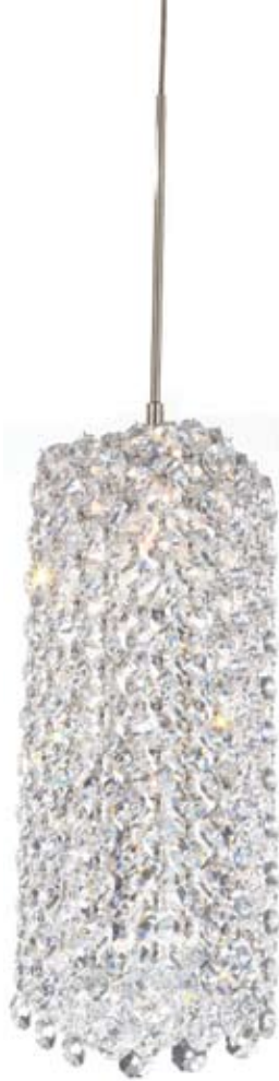
FJ-RE0409A-12-SN Grade A Clear