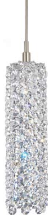
FJ-RE0209A-12-SN Grade A Clear