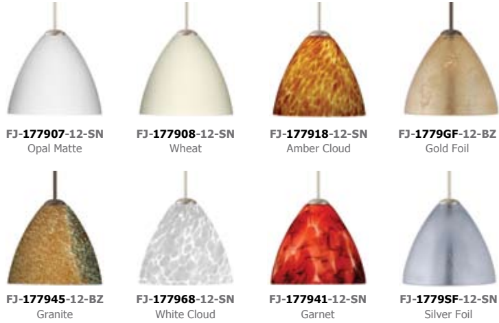
FJ-177907-12-SN Opal Matte