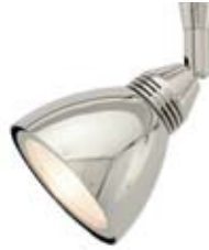
FJ-LOW-1-PN-S1-PN Polished Nickel with Polished Nickel S1 Shade