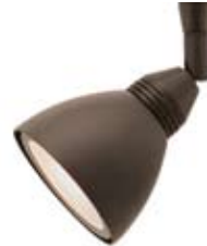
FJ-LOW-1-BZ-S1-BZ Antique Bronze with Antique Bronze S1 Shade