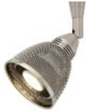
FJ-LOW-1-SN-S2-PN Satin Nickel with Polished Nickel S2 Shade & LED MR16 lamp