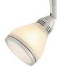
FJ-LOW-1-SN-S3-WH-SN Satin Nickel with Satin Nickel S3 White Shade