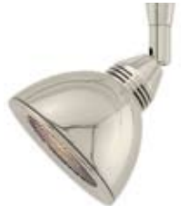
FJ-LOW-1-PN-S5-PN Polished Nickel with Polished Nickel S5 Shade