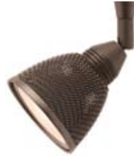
FJ-LOW-1-BZ-S2-BZ Antique Bronze with Antique Bronze S2 Shade