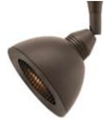
FJ-LOW-1-BZ-S5-BZ Antique Bronze with Antique Bronze S5 Shade