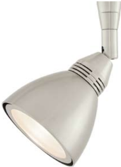
FJ-LOW-1-SN-S1-SN Satin Nickel with Satin Nickel S1 Shade