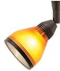
FJ-LOW-1-BZ-S3-AM-BZ Antique Bronze with Antique Bronze S3 Amber Shade