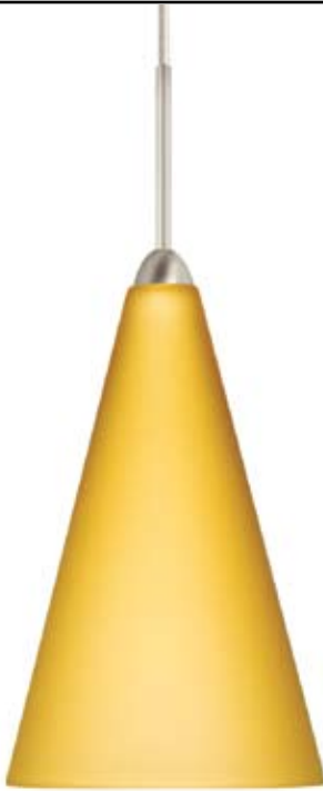
FJ-1382VM-12-SN Vanilla Matte