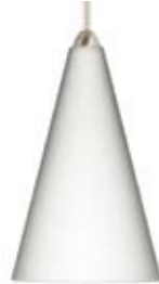
FJ-138207-12-SN Opal Matte