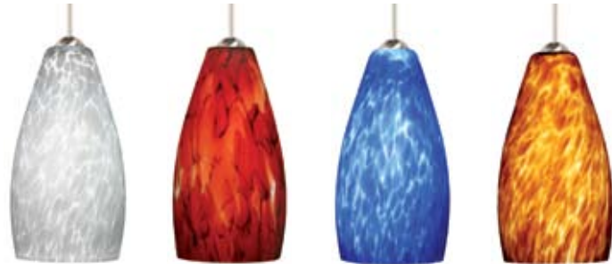
FJ-719868-12-SN White Cloud FJ-719841-12-SN Garnet FJ-719886-12-SN Blue Cloud FJ-719818-12-SN Amber Cloud