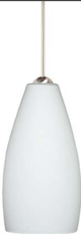
FJ-719807-12-SN Opal Matte