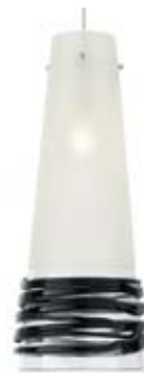
FJ-20120BLK-12-SN Satin with Black