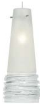
FJ-20120CLR-12-SN Satin with Clear