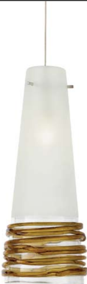
FJ-20120AMB-12-SN Satin with Amber