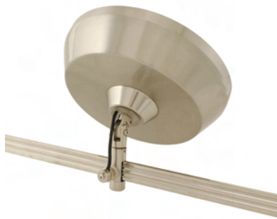
M2T-2x150-SL2-SN Monorail 2-Circuit 2x150 Watt, 12 Volt Surface Mount Transformer with 2" Slope shown.