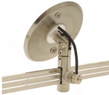
M2P-4RD-SL2-SN Monorail 2-Circuit 4" Round Power Feed Canopy with 2" Slope shown.