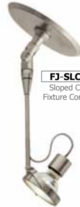
FJP-4RD-SN 4" Round Canopy