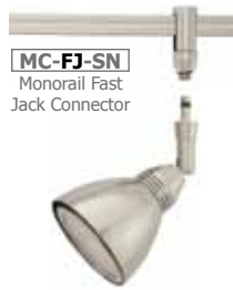
MC-FJ-SN Monorail Fast Jack Connector