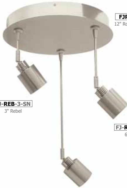
FJP-12RD-3-SN 12" Round 3-Port Canopy